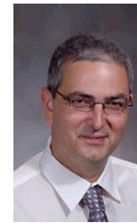
Head of Neurogastroenterology Service, Gastroenterology Division, Beilinson Hospital, Rabin Medical Center