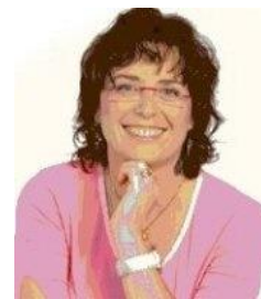
Associate Professor of Psychiatry Head of the ADHD Unit, Geha Mental Health Center