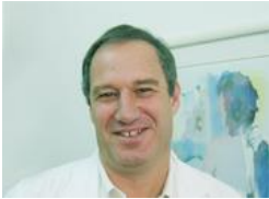
Director of Women's Hospital, Rabin Medical Center