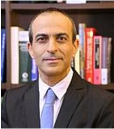
Director General, Tel Aviv Sourasky Medical Center