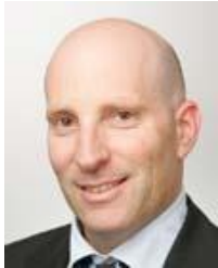
Chief Executive Officer, InsuLine Medical Ltd