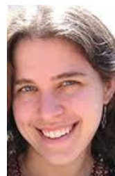
Director Translational Policy, Clalit Health Services