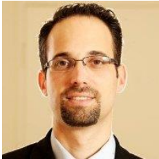
Director, Clalit Research Institute, Clalit Health Services