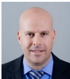
Vice Director General, Head of Technology Industries Division Israel Export Institute