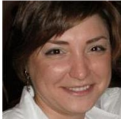
Director Life Sciences Department, Israel Export Institute