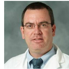
Head of the Comprehensive Breast Care Clinic, Rabin Medical Center